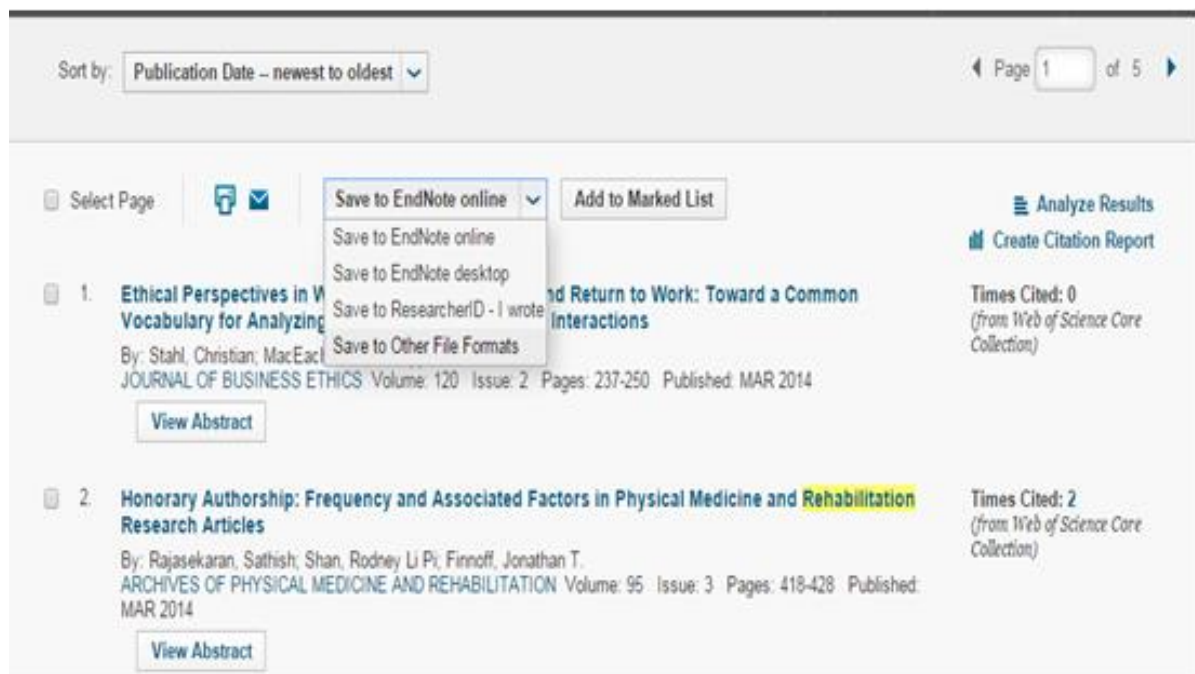
Fig. 2: Saving the file as Bibtex

The file was saved with all these data as a Bibtex fill the author, world title, source (journal) and abstract were automatically selected and included. (Fig. 2)