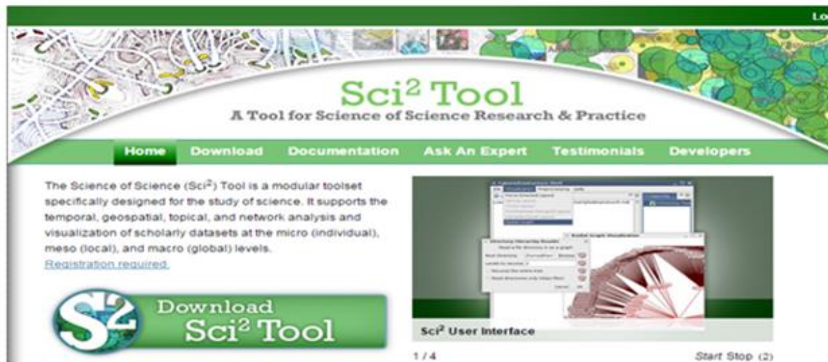
Fig. 3: Image of website software Sci2 Tool

For scientometric analysis, the software Sci2 Tools was used. (Fig.3)