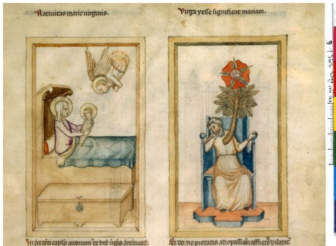
Fig. 1. Nativity of the Virgin , Paris, National Library of France, Ms. Arsenal 593, Speculum humane salvationis , Bologna, fourteenth century, fol. 6.

(Last accessed: 23 March, 2018, http://mandragore.bnf.fr/jsp/rechercheExperte.jsp )