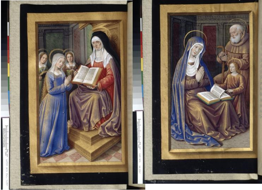
Figs. 7, 8. Mary learning to Read helped by Saint Anne, Mary teaching Christ Child to Read , Paris, National Library of France, Ms. Latin 9474, Book of Hours use of Rome/ Hours of Anne of Brittany , France, Tours, 1503-1508, fols. 197v and 222v.

(Last accessed: 23 March, 2018, http://mandragore.bnf.fr/jsp/rechercheExpert.e.jsp )