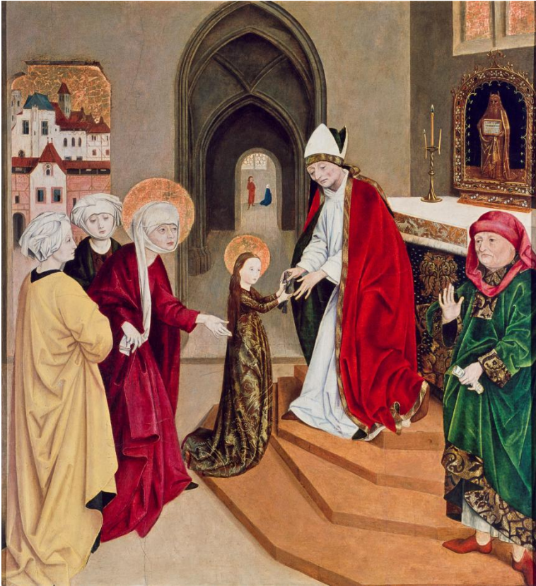
Fig. 9. Presentation at the Temple , Vienna, Museum of the Scots' monastery, panel painting of a winged altarpiece, Master of the Scots' altarpiece, Vienna, 1470s.

episodes highlighted by the Speculum or the Legenda Aurea . Some of these representations are found in Salzburg, Tirol, Vienna, and Klosterneuburg in Austria, or Freising and Hamburg in Germany. Generally, they are fifteenth-to-sixteenth-century winged altarpieces or panel paintings. In the following example, I offer one short case study in order to emphasize various incorporations into the visual material.