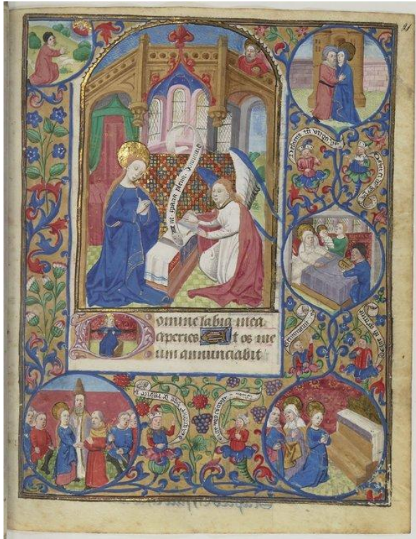
Fig. 5. The Annunciation , Paris, National Library of France, Ms. 1175, Book of Hours , use of Paris, France, fifteenth century, fol. 21.