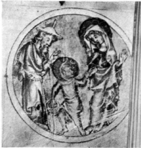
Fig. 4. Christ Child's life (episode) , Ms. Gen. 8, folio 29, 1330, Austria. Municipal Library, Schaffhausen, Austria. Reproduced in Elisabeth Landolt-Wegener, Zum Motiv der "Infantia Christi" in Zeitschrift für schweizerische Archäologie und Kunstgeschichte 21 (1961): 171.

century hagiographic collections. 11 In an Italian manuscript 12 episodes of Mary's life are interpolated with that of Christ. When referring to the Flight into Egypt , for instance, one can note that the Christ Child is much more active and increased in size in contrast to more condensed representations that are found in the Speculum Humanae Salvationis/Historiale . As well, this imagery implies closeness to the text.