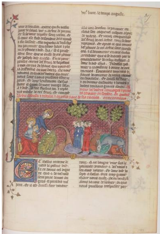
Fig. 3. Miracle of the Palm Tree , Paris, National Library of France, Ms. Français 316, Speculum historiale , Paris, 1333, fol. 307v.

century Italian manuscript (fig. 1 and 2). 7 As well, this pattern is found in other French versions of the Speculum Humanae Salvationis . 8