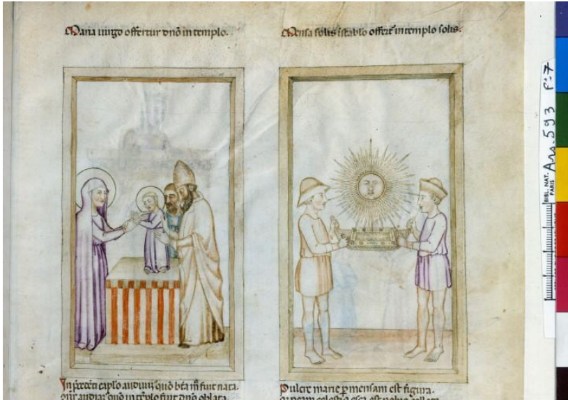
Fig. 2. Presentation at the Temple , Paris, National Library of France, Ms. Arsenal 593, Speculum humanae salvationis , Bologna, fourteenth century, fol. 7. (Last accessed: 23 March, 2018, http://mandragore.bnf.fr/jsp/rechercheExperte.jsp )

Most of the collected representations 6 are found in versions of the Speculum Humanae Salvationis and Speculum Historiale , they are either from France, including French speaking territories, Germanic areas and to a lesser extent Italy. Generally, the representations belonging to versions of the Speculum Humanae Salvationis are typological representations in which episodes of Mary's life are paired with some of the Old Testament as it follows: Nativity of Mary - Tree of Jesse , Betrothal of Mary and Joseph - Betrothal of Sarah and Tobias , or more allegorical ones such as the Presentation at the Temple - Fishermen/Representation of a Temple ; Mary defeating the Devil - Judith beheading Holofernes , as is found in a fourteenth-