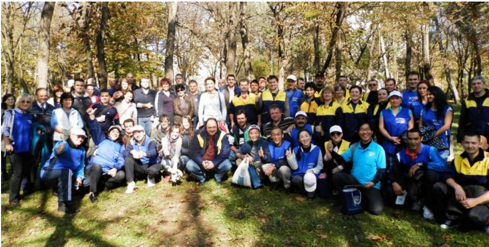
Fig. 8. Volunteers of the 4 th “5S Public action – Cluj is shining with cleanliness” - 2013

For starters, the feed-back offered by the participants at the actions reflected the fact that part of them sent further to their families and friends information received regarding the experience in participating and the benefits of the KAIZEN management in private life. Therefore, people discovered that they can better plan their daily activities and resources, maximizing their potential and even working more efficient. As effect, one can say that the purpose of the actions, to extend its boundaries outside the company and the actual action was reached.