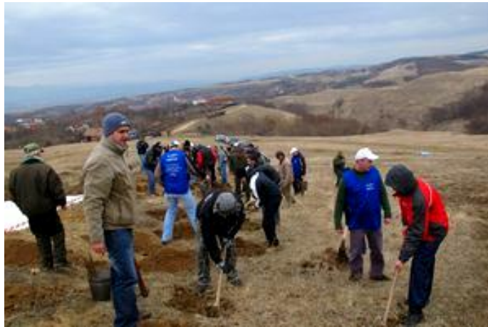
Fig. 2. The volunteers of the first “KAIZEN for People and Nature” action in Gemba

The project ended with the “KAIZEN for People and Nature” which aimed the harmonious development of young people and, implicitly, the increase of the value brought by them to society. The action consisted in planting trees in Oarda locality, 5 km from Alba-Iulia City, with the help of 118 volunteers.