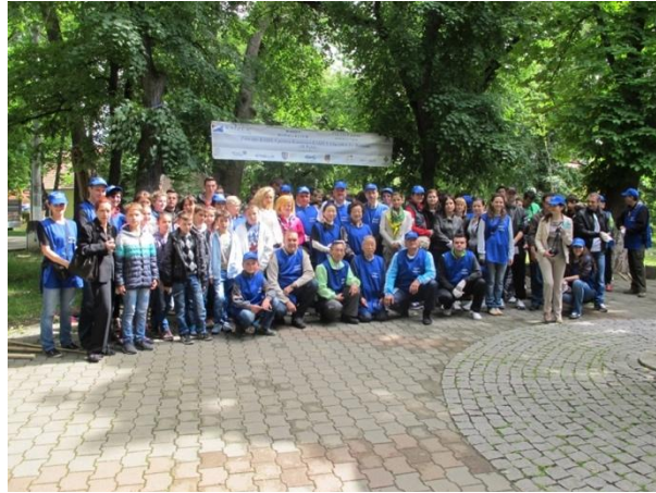
Fig. 6. The volunteers of the 3 rd “5S Publication – KAIZEN education for Romania”

After closing the action, the work tools were cleaned and they were arranged according to category as they were at the beginning. The event closed according to custom with a group photo.