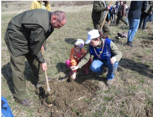
Fig. 4. Volunteers during the “KAIZEN for people and nature” action – 2 nd Edition 2013

Once arrived in gemba (Mereteu, Vintu de Jos Commune) and before planting began, RNP Romsilva responsible presented the main security rules, they instructed the team leaders and awarded the sectors for each team. For the next hour the 130 volunteers, helped by the forestry staff, have planted 600 acacia trees. For part of the volunteers this action represented a first opportunity to plant trees. Most volunteers expressed their enthusiasm in participating in the next editions.