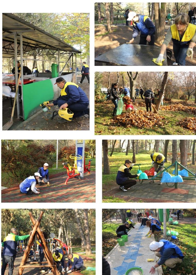
Fig. 7. Volunteers during the action “Cluj is shining with cleanliness” – 4 th edition 2013

Detunata Park was selected. The volunteers were divided into 10 teams and, according to the sector assigned, they gathered leaves, they cleaned the paths of grass and swiped them, they cleaned the children swings, the urban furniture for adults and the garbage bins, they removed the dried paint off the banks, tables, chairs and a gazebo and re-painted them.